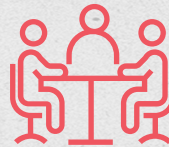
Key Informant Interviews